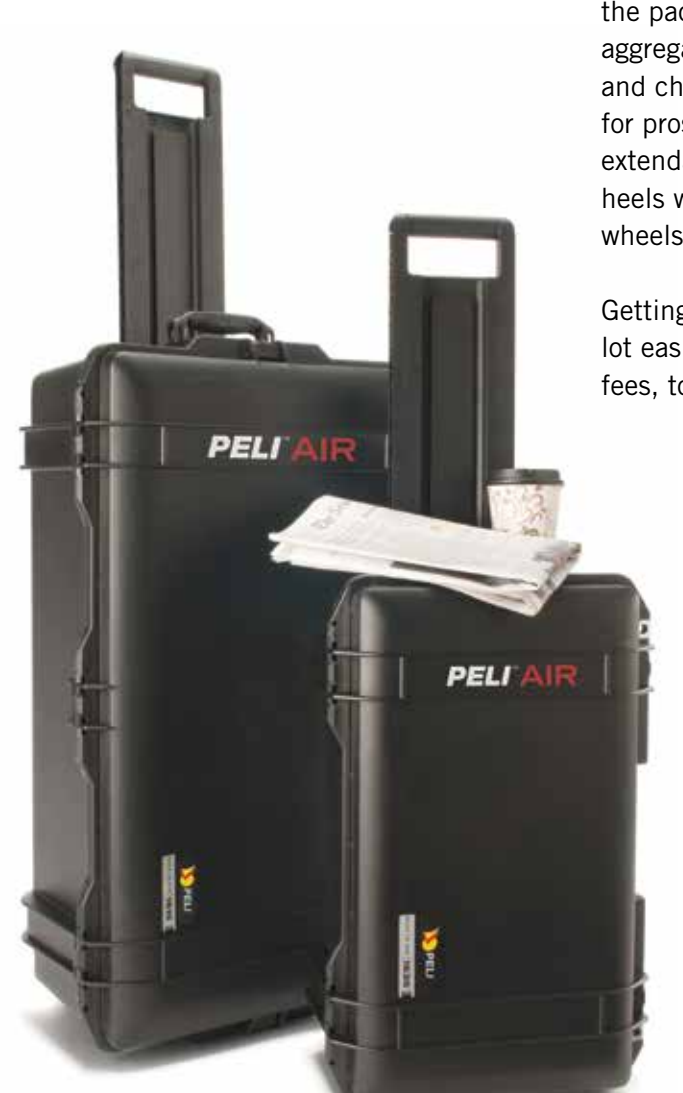
*Check with your airline for exact measurement requirements

Getting through the airport with a Peli^{\mathbb{T}} Air case is a lot easier, and saves money on over-weight luggage fees, too.