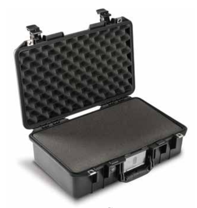
Pick N Pluck™ Foam