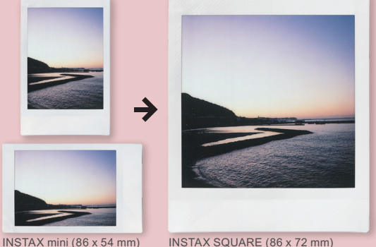
INSTAX SQUARE (86 x 72 mm)