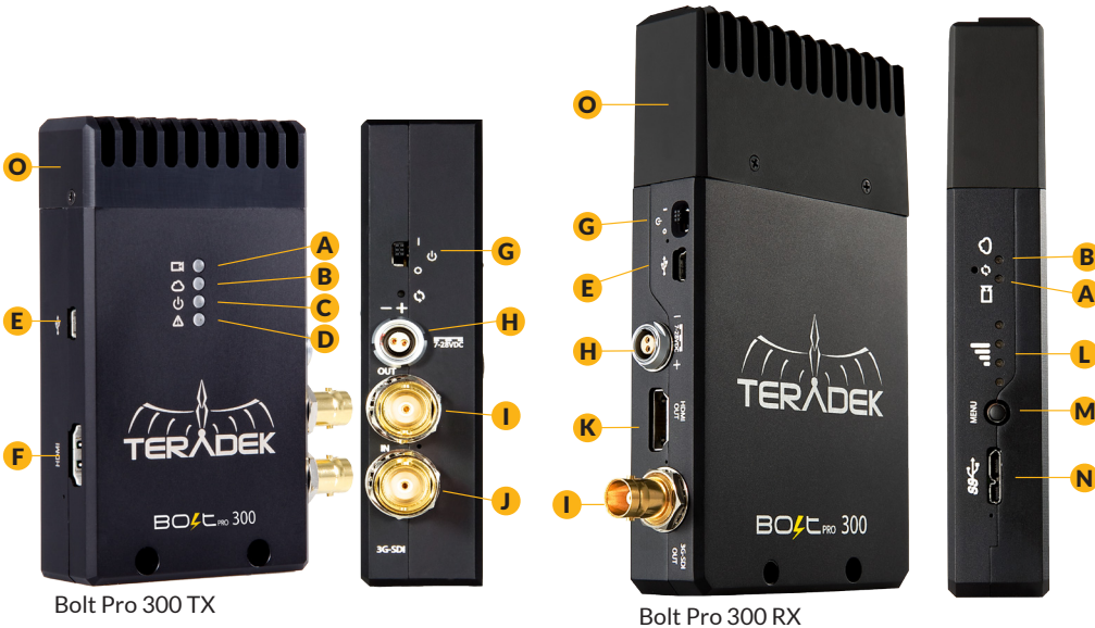
Bolt Pro 300 TX