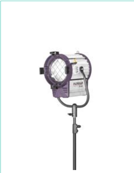
Tungsten Fresnel 1000W Junior