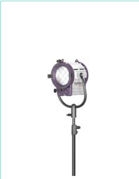
Tungsten Fresnel 650W Junior