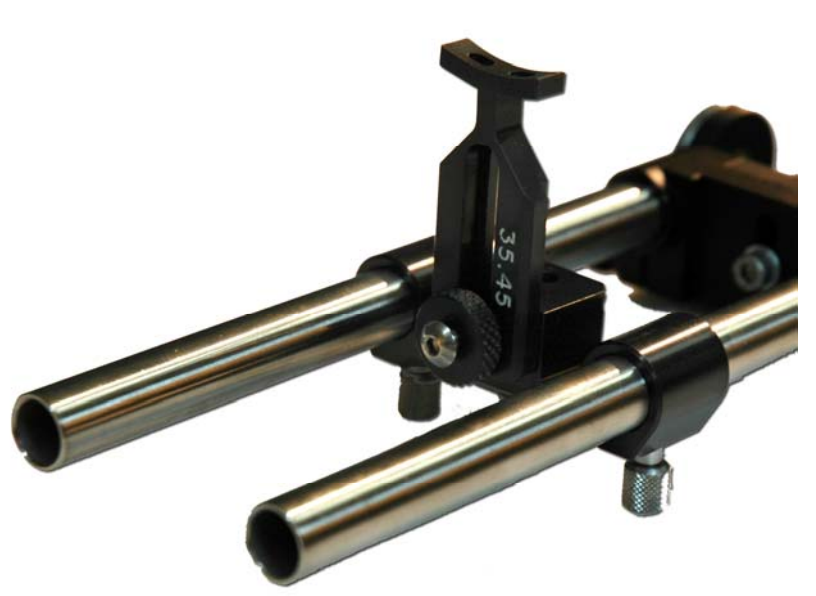
Canon Lens Support Bracket fitted onto 15m/m Bars