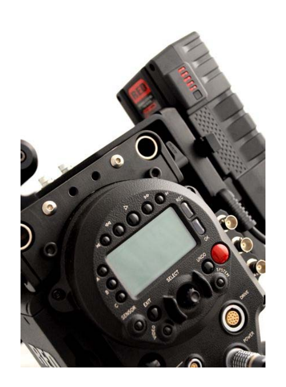
'Red' Camera Battery Bracket