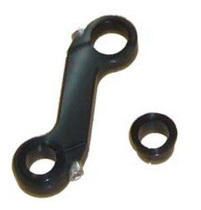
'S' Bracket & 15-19m/m bush For lens control mounting

For use with 'Pro35'. This clamp is used to hold all four rods taught.