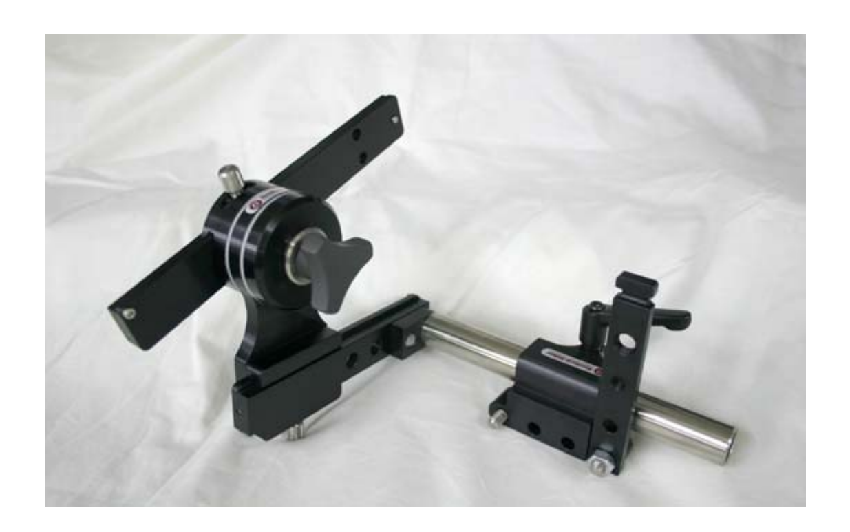
'Red' Camera EVF Mount