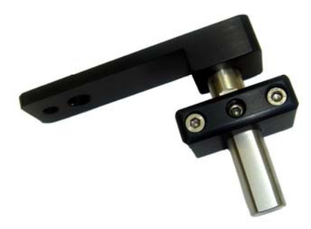
Sony Acc. Mount