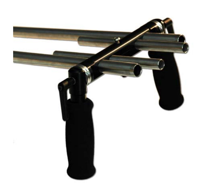
Designed to fit both 15m/m & 19m/m Bars