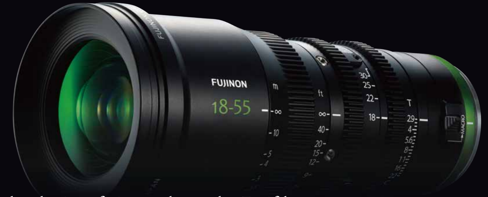
Image expression moves into a new era, thanks to the unique optical technologies of cinema lenses by Fujifilm