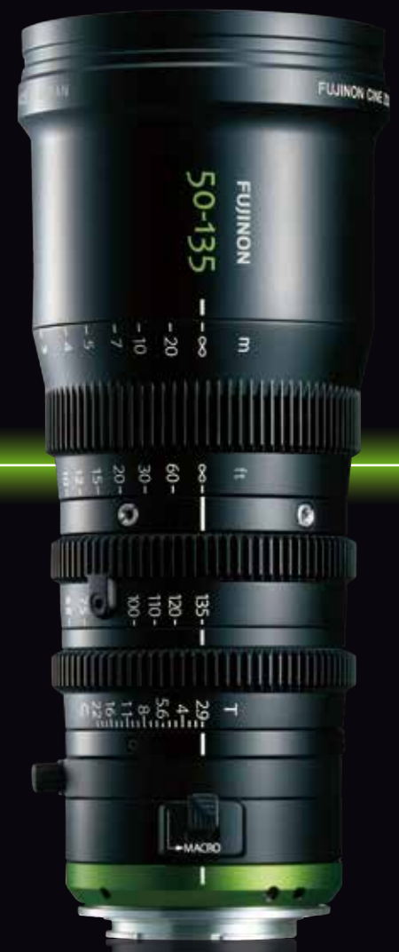
On sale summer 2017 MK50-135mm T2.9